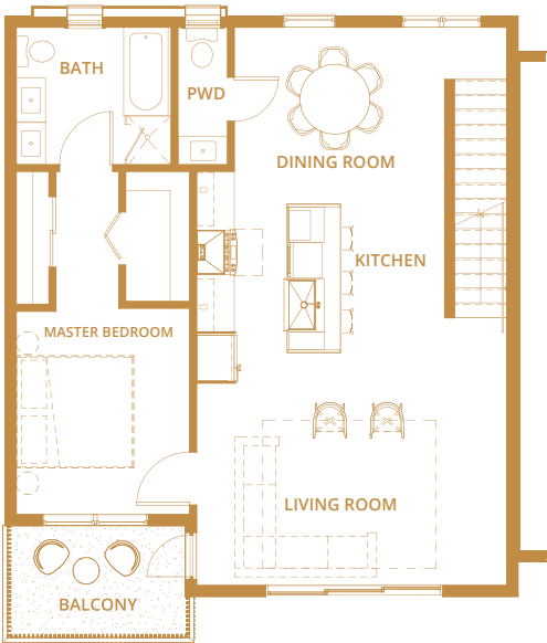
SECOND FLOOR: 901 SQ. FT.